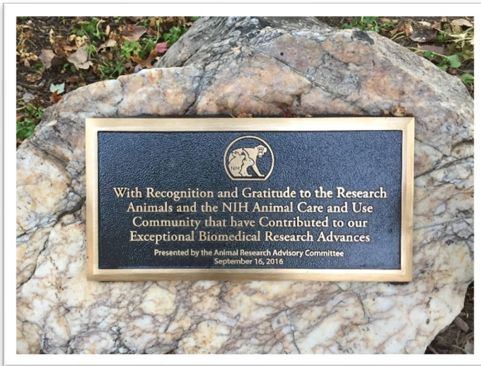
Plaque to recognise the contribution made by animals to advances in research

I was met bright and early for my short trip to the NIH. After hearing the stories about the size of NIH it was finally time to experience it for myself. Nothing can prepare you for the size of the place. The security is very tight and it takes a small while to get through and get clearance.