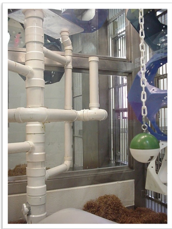
Communal Area for NHP

The next day, (after a little bit of a sleep in) saw me once again travelling to NIH where I was very lucky to have a chat with a researcher who resided from the UK but has been in the US for many a year now working within neuroscience. I was very lucky to be treated to an in depth talk about his work, which was truly fascinating and I was able to view a trial in progress. This is something that I would not probably have been able to witness in my time as an animal technician and thanks to the fellowship I am thankful that I have. I was shown the communal play area for the non-human primates, this highlighted NIH commitment to welfare of their animals as it demonstrated careful consideration for the primates needs, and it was very impressive.