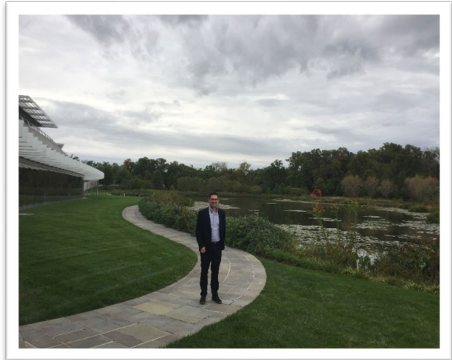
The impressive facilities at Janelia