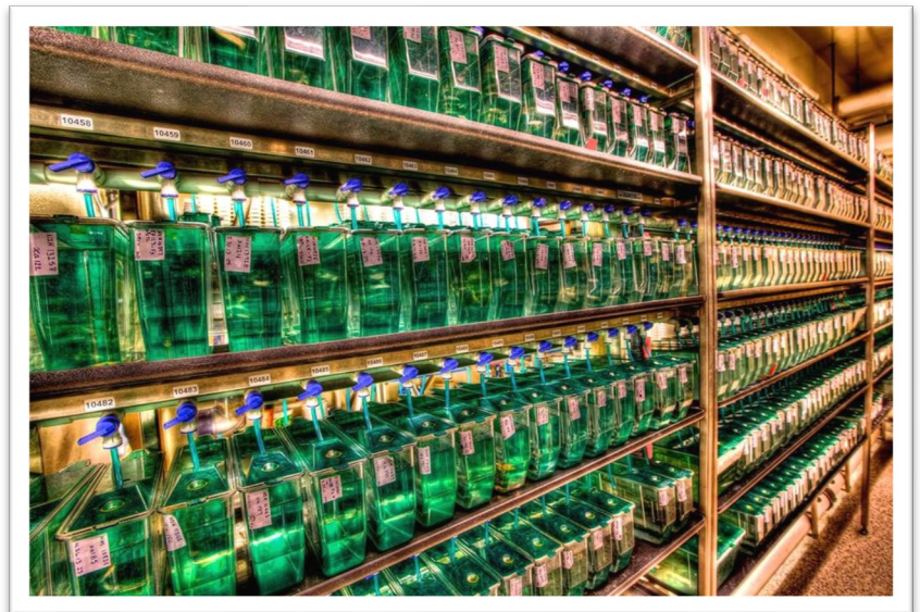
Excellent aquatic facilities at NIH

Before lunch I was given an insight into the aquatic facilities. I have had very limited experience of fish over the years but having an interest in fish in general, this was something I was looking forward to. This was a facility to behold, I believe it is one if not the biggest fish facilities in the world, it was immense. I was introduced to (and very impressed with) their care programme in place, and the expertise within this facility can only be applauded. To be able to pick up on potential issues takes dedication and knowledge at the highest standard. I was able to witness the environmental enrichment practices in place and the area was spotlessly clean, a real credit to all who work in the facility.