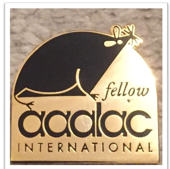
AAALAC Fellowship pin badge

To apply and receive the award, it doesn't matter if you manage 1 or 100 staff, it doesn't matter if you manage 1 or 10 facilities you can still be selected, what is important is that you demonstrate a clear passion to improve the lives of the animals we look after on a daily basis, and display a strong willingness to help others excel within the profession. In winning the fellowship in 2019 I hope I can inspire others to apply for the fellowship, as it is truly an honour and a privilege.